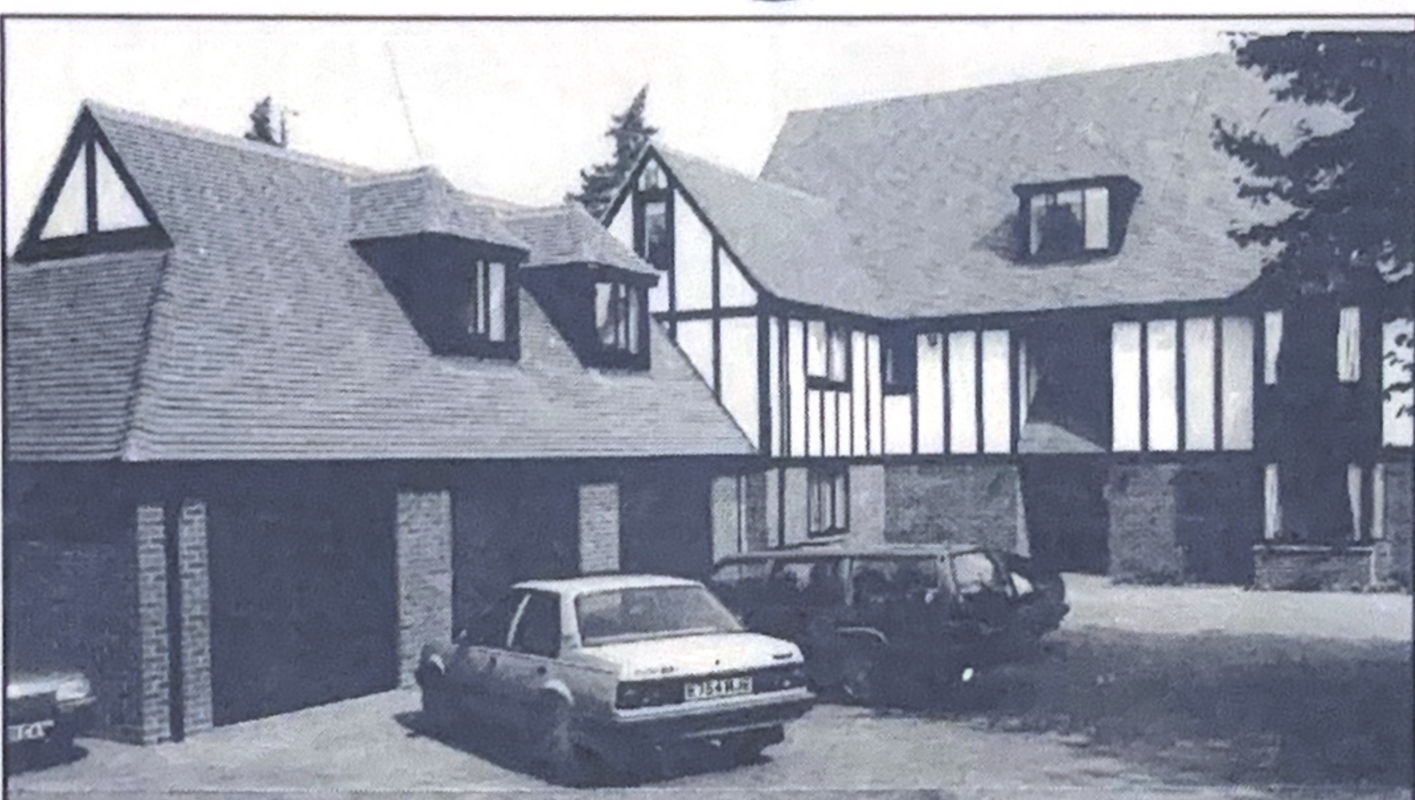
■ This stunning executive home was built by Salmons Brothers Roofing and Building Contractors. The company is less widely known for its building skills.