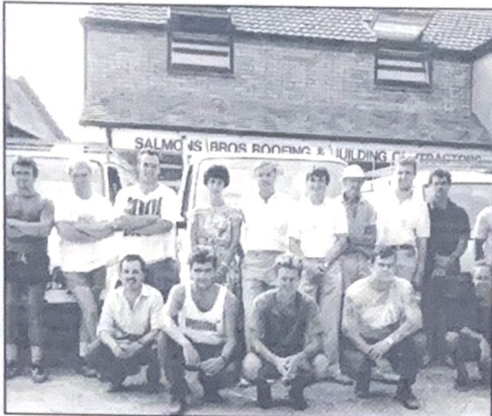
■ The team at Salmons Brothers of Church Lane, Ely.

A FAMILY business to the very last, Salmons Brothers of Ely is this year celebrating its 25th birthday.